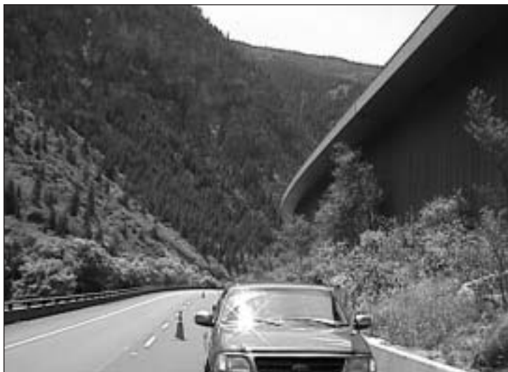
The cantilevered concrete bridges of I-70's western route rising above the scenic highway's eastern route

Colorado's Glenwood Canyon corridor, with I-70 snaking through it for 12.4 miles, is not only one of the most beautiful highways in the country, but a true marvel in engineering design. It has won numerous construction and design awards.